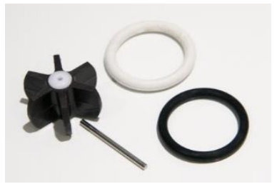
Replacement Paddlewheel Kit for A+T and B&G SOVs.

<u>Isolation kit – used when valve is fitted to</u> <u>carbon, aluminium or steel hulls</u> Replacement for B&G 155-30-017.